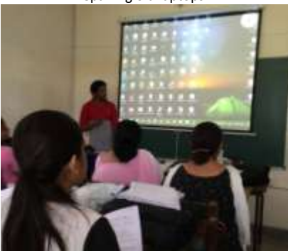
Train the trainers for partner organizations