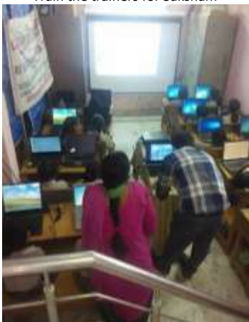
Classes on at Nai Kiran Ardee City.

In Model 1 we partnered with a mix of primary, middle and secondary schools but as we move ahead we are so glad that Computer Shiksha is reaching out to not only schools but is setting up learning centres across a wide variety of partner organizations. For eg. Mahila Chetna Kendra is a Self Help Group of village women in Dera. Prayas Observational Home is a short stay home for juveniles in conflict with law. SPYM i.e. Society for Promotion of Youth & Masses is a non-profit organization working towards the prevention of drug abuse