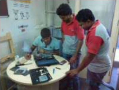
The Computer Shiksha team working on repairing old laptops.