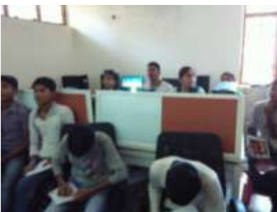
Train the trainers for Saksham